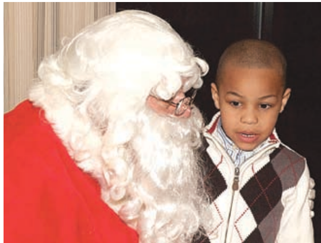
Santa takes another stocking request from a WTU family member during the chapter's 3rd Annual Holiday party held at Fort Belvoir in December.

The Fairfax-Lee Chapter hosted its 3rd annual Holiday Party on 15 December 2009 for the Wounded Warriors and families assigned to the