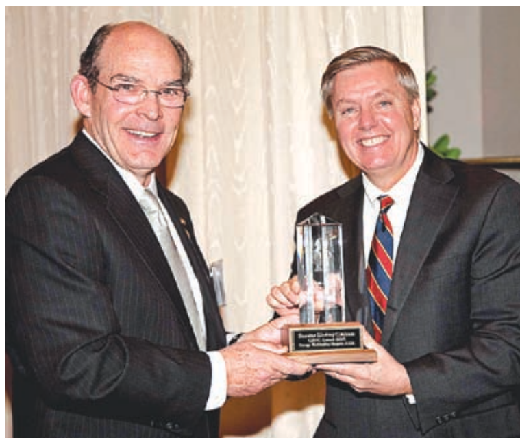
Senator Lindsey Graham accepts CINC award.

A member of numerous Senate committees, including Armed Services and Judicial, Graham said he was ready for