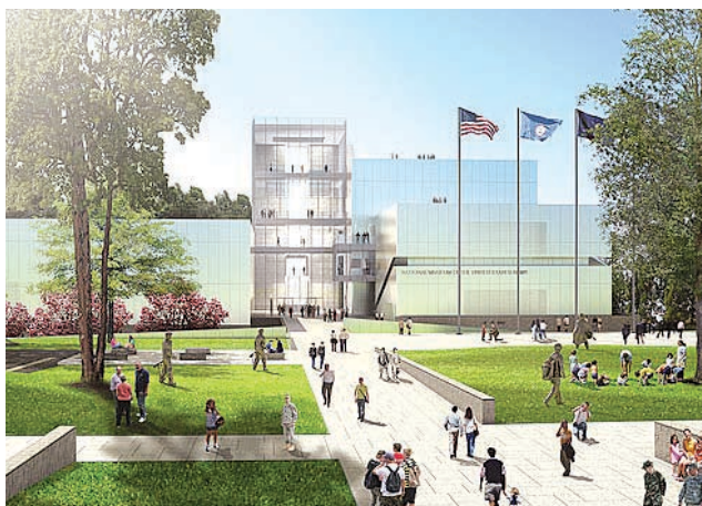
National Army Museum

For far too long the US Army has lacked both a comprehensive story place and a fitting tribute to relate and recognize the personal and professional sacrifices of its Soldiers. It is now time to hear them, and to say thanks to fourteen generations of American Soldiers whose leadership, character, and selfless sacrifice have forged and safeguarded our nation for over two centuries. A great Army deserves a great Museum. To understand ourselves, our country,