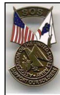
Antique - $5

See our website for more information: www.ausafairfax.org