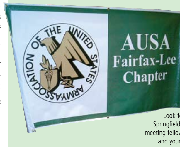
Look for this sign in the Springfield Hilton and enjoy meeting fellow AUSA members and your chapter officers!

From I-95 North, take exit 169A Franconia Road (Route 644 East). At the first stop light make a LEFT onto Loisdale Road. At the next light turn LEFT onto Loisdale Court. You will find the entrance to the Hilton Hotel parking lot at the end of the court on your right.