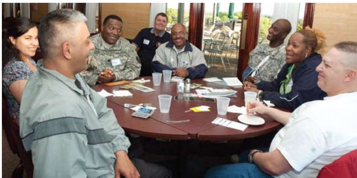
Nearly 100 soldiers and family members attended the Fairfax-Lee Chapter "Salute To Soldiers!" event in late April.