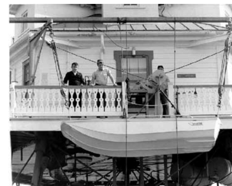
Crewmen lowering Boston Whaler from station in 1968.

In 1972 the station felt the effects of tropical storm Agnes, which raised 23-foot waves and brought them crashing down upon the cottage and foundation. The lighthouse managed to survive the assault with only minimal damage, but for a while there was some question if it would survive the Coast Guard's announcement that