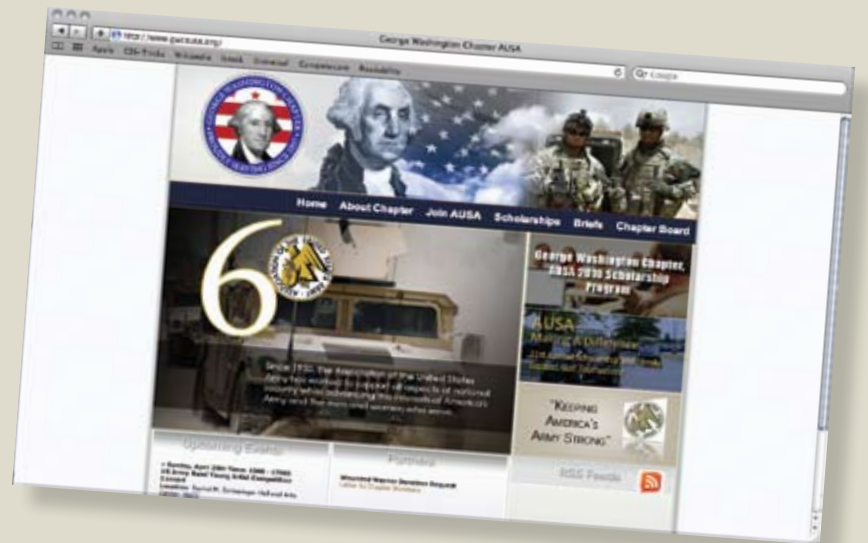
George Washington Chapter www.gwcausa.org

NON-PROFIT U.S. POSTAGE PAID DULLES, VA PERMIT #163