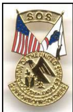
Special Edition - 24K Gold Plated - $10