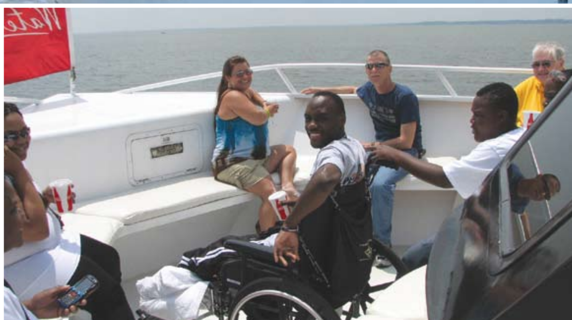
Soldiers and their families relaxing on the aft deck.