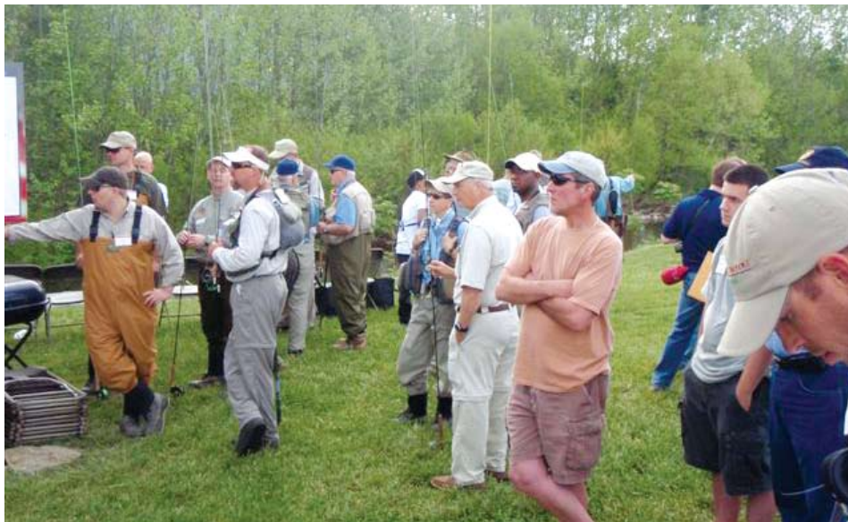
Wounded Warriors & their professional guides receive last minute instructions.

I would like to personally thank the Chapter leadership for stepping up and supporting Project Healing Waters Fly Fishing Inc. and the support it provides to these wounded warriors.