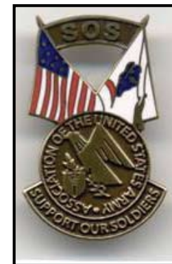
Antique - $5

See our website for more information: www.ausafairfax.org