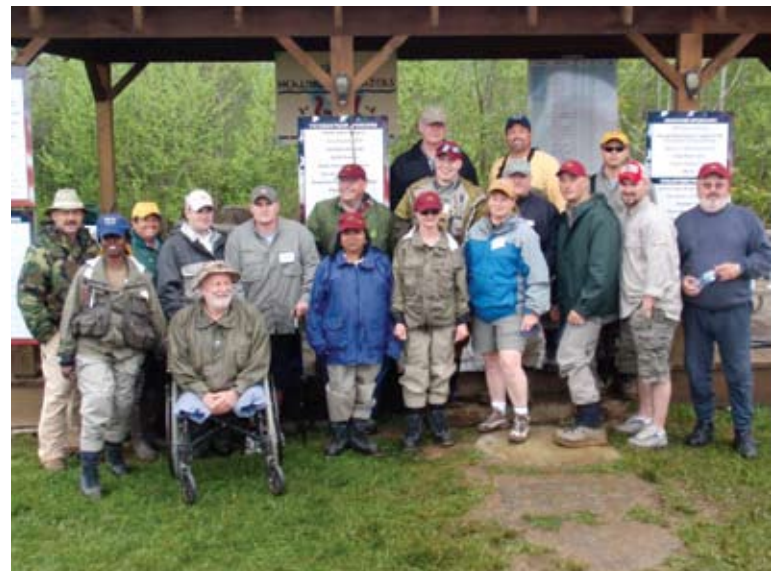
Wounded Warriors from Walter Reed Army Medical Center compete in Fly Fishing Tournament to benefit their fellow soldiers.

PROJECT HEALING WATERS continued on page 2