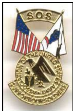
Special Edition - 24K Gold Plated - $10