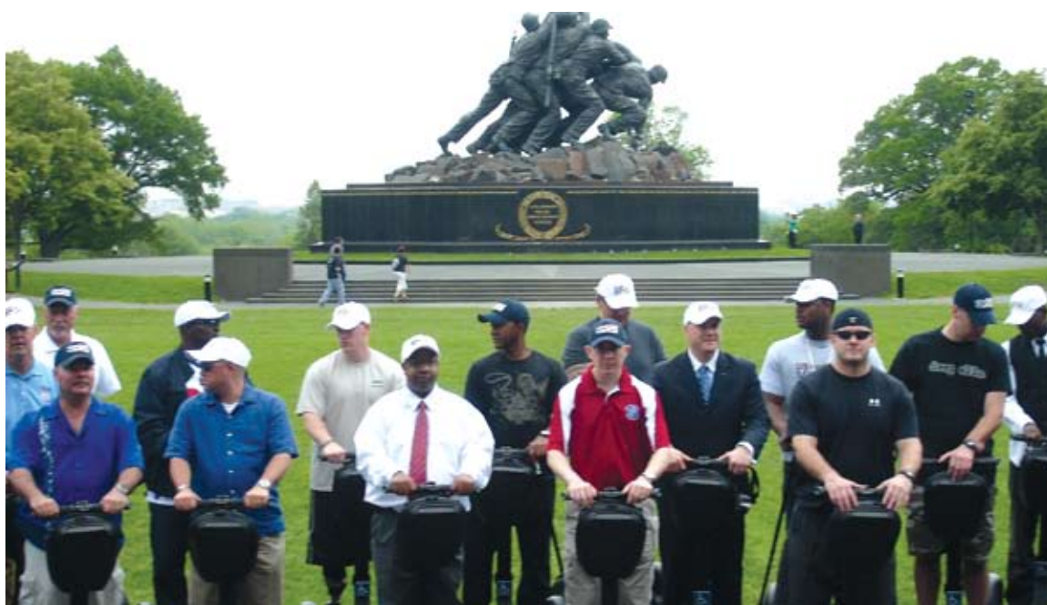
Wounded Warrior recipients with their Segways