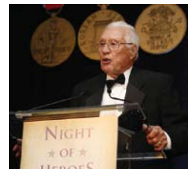
Bob Feller shares his WWII story at the Night of Heroes Gala.

The event raised over $400,000 thanks to the PFCU Foundation.